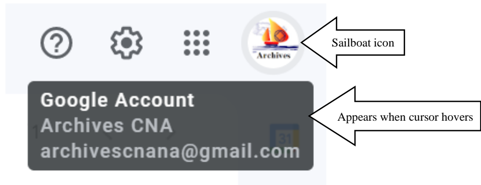
Figure 1 – Google Account Information